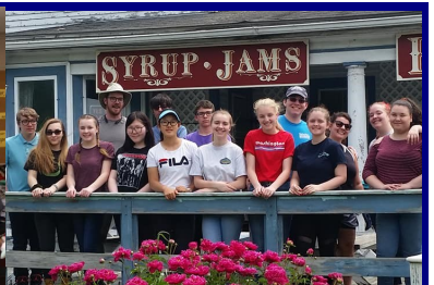
Helping an older couple and a Veteran