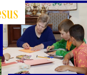
BPI & Local Church Help