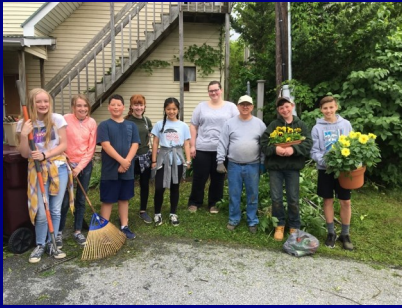
Serving at True North Pregnancy Center

Our students learn how to help and serve others from our community to around the world!